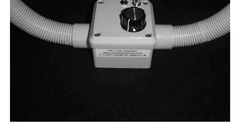
Enhances reception and increases the quality of your listening experience!